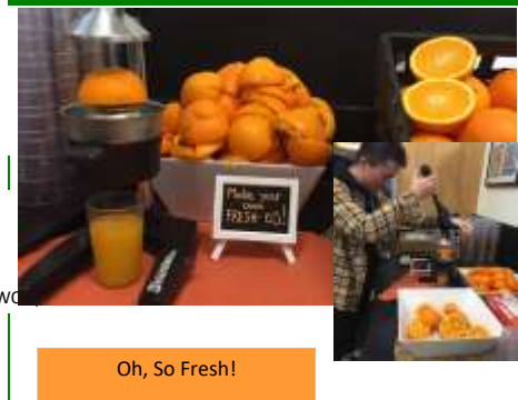
Oh, So Fresh!