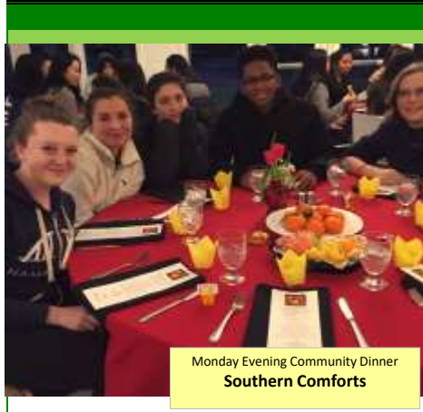
Monday Evening Community Dinner Southern Comforts